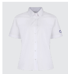
Twin Pack Shirt or Blouses