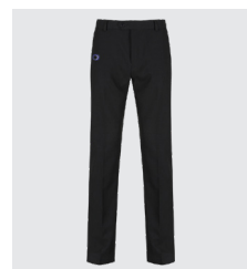
Trousers or Skirt