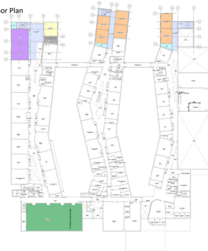
Proposed First Floor Plan

On the first floor the new rooms will be 2 Science classrooms, 6 general teaching classrooms, 1 ICT room and additional toilets. New staircases are also added to meet fire safety regulations.